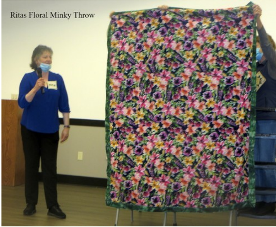
Ritas Floral Minky Throw